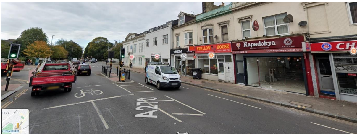
We understand the location of the new premises is shown on the image as Kapadokya.